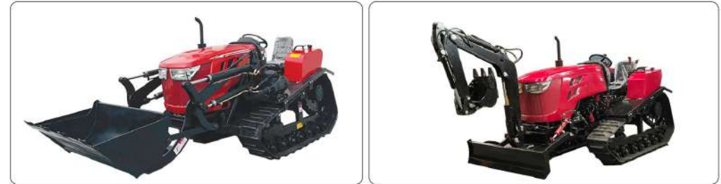
Sunway Swct-802 Series Crawler Tractor