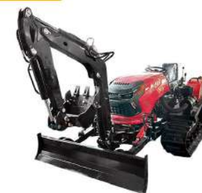
Sunway SWCT-502 Series Crawler Tractor