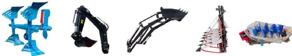
Hydraulic Flip Plow