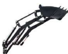
Front Loader Bucket