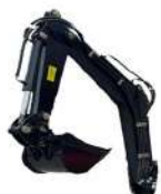
Excavator Boom and Bucket