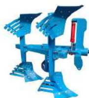
Hydraulic Flip Plow