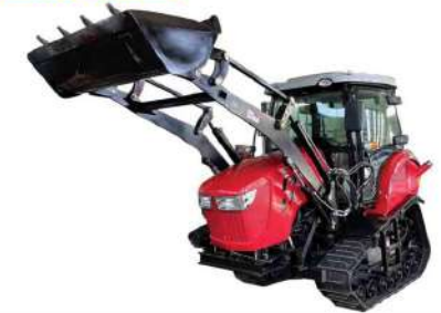
Sunway Swct-1202/1302 Series Crawler Tractor (attachments are optional)